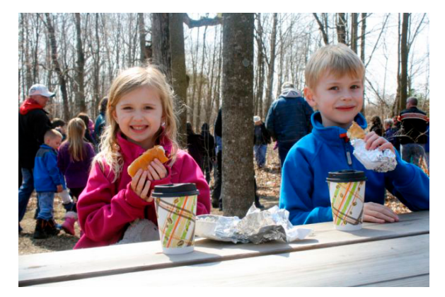
Enjoying hotdogs - all part of the event.