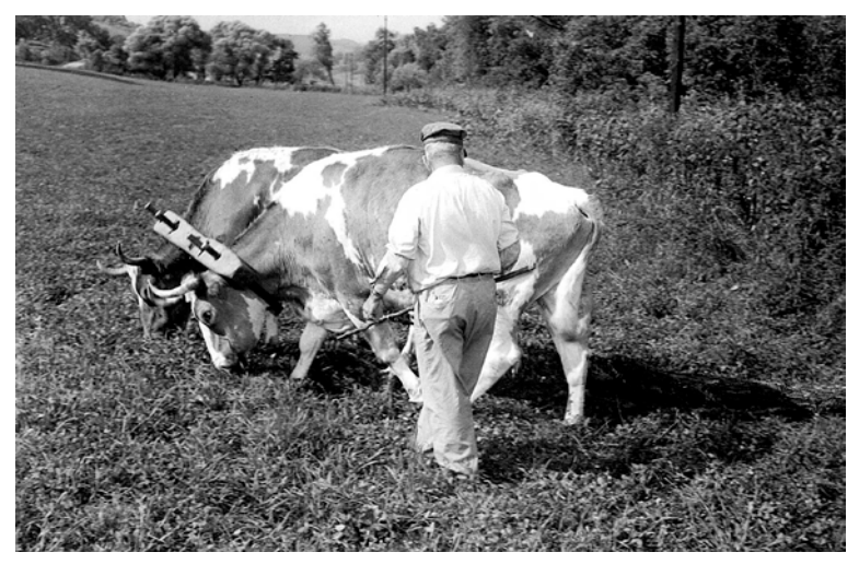
Two oxen, Tom and Jerry, hitched together with a yoke. Rockton, Wisconsin, September 1946

Oxen are not a breed of cattle but rather steers – adult, male bovines that have been castrated. They come from bull calves of any breed of cattle and are castrated and taught to follow voice commands and work with humans. Male cattle are selected because they grow to be larger than the females, and cows are more valuable for their milk and their ability to produce calves.